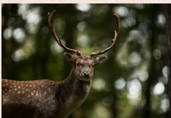
Fallow Deer (Oceania)