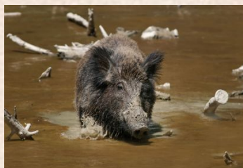
Wild Boar (Oceania)