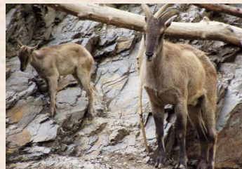
Tahr, Himalayan (Oceania)