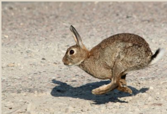
Rabbit, European Wild