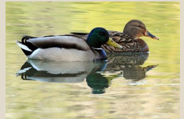
Duck / Mallard