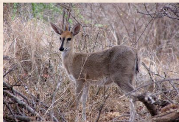
Duiker, Grey/Duiker, Grimm's (Common)