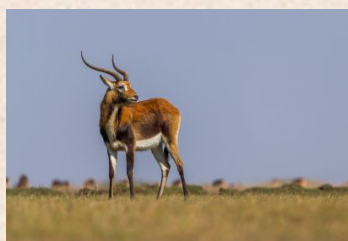
Red Lechwe/Black Lechwe/Kafue