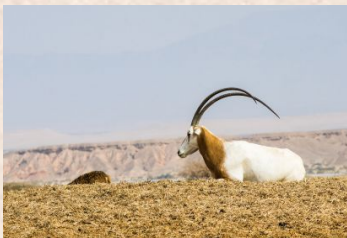
Scimitar Oryx/Scimitar- Horned Oryx