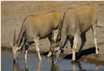
Eland, Cape/Livingstone, Patterson's