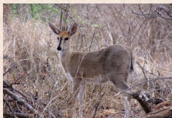
Duiker, Grey/Duiker, Grimm's (Common)