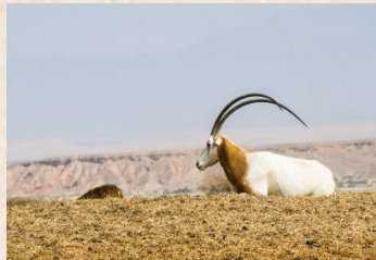
Scimitar Oryx/Scimitar- Horned Oryx