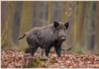
Wild Boar (Europe)