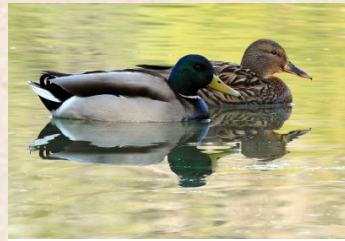
Duck / Mallard