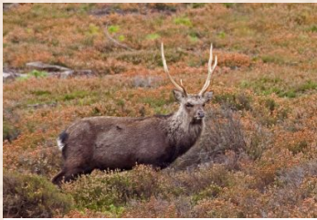
Sika Deer (Europe)