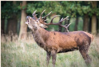
Red Deer/Red Stag (Europe)