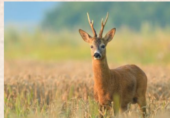
Buck/Roe Buck/Roe Deer (Europe)