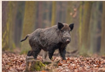
Wild Boar (Europe)