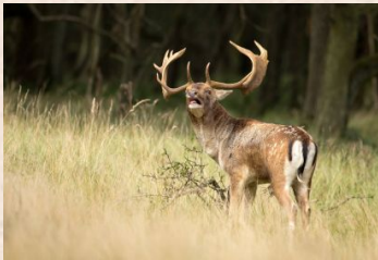
Fallow Deer (Europe)