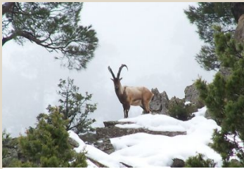
Wild Goat/Bezoar Ibex