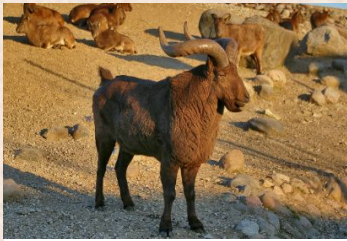
Tur, East Caucasian/Dagestan Tur